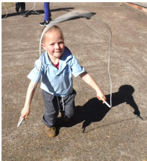
Jump Rope for Heart practice